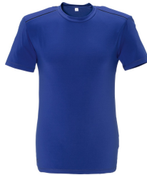
royal blue/black 2962