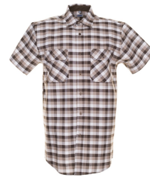
stone checked 0488