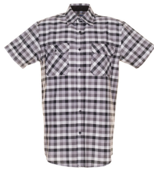
black checked 0486