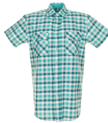
green checked 0487