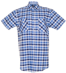
blue checked 0485