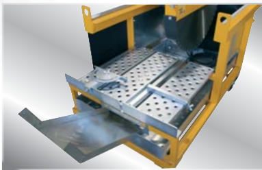
removable water container

now available with forklift slots and pluggable water pump