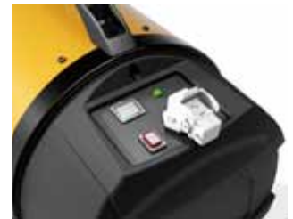
DISPLAY AND SOCKET FOR REMOTE THERMOSTAT