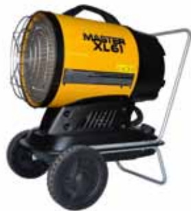
XL 61 WITH TROLLEY