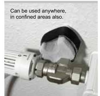
Can be used anywhere, in confined areas also.