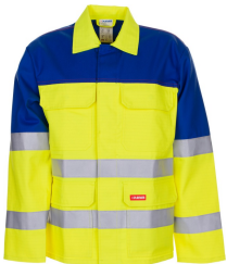
yellow/royal blue 5202