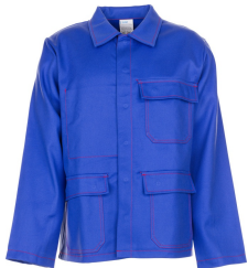
royal blue 1732