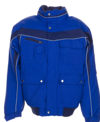
royal blue/navy 2591