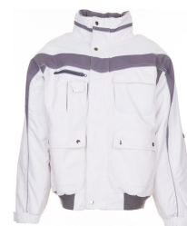
pure white/zinc 2593