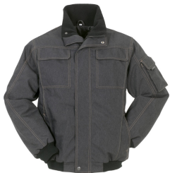
midnight blue 3751